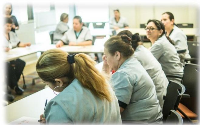
The Heart Healthy Living Seminar was well attended by staff members