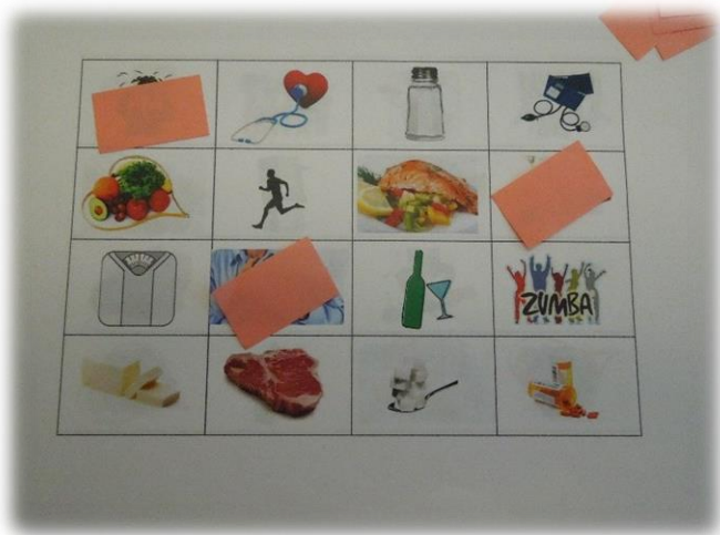
A game created by Spanish 322 students to reinforce Heart Healthy Lifestyles