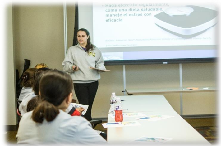
A student discusses healthy lifestyles with Rice employees