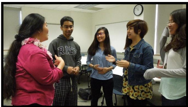
Students in Japanese 142 discuss the upcoming Rice-in-Japan

The Center for Languages and Intercultural Communication recently expanded its Rice-in-Country study abroad program to include Rice-faculty taught courses in Argentina, China, France, Germany, Japan, and Spain. This year, over $200,000 were available in grants to students looking to study abroad through CLIC, and over sixty students were awarded full and partial scholarships, with an average grant of $3,000.