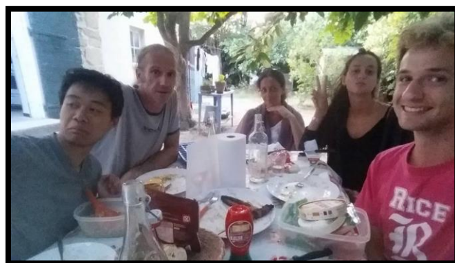
Rice students sharing a meal with their host family in Aix-en-Provence, France.

While studying abroad, students will also have the opportunity to immerse themselves in meaningful cultural opportunities. Service work will be an integral part of the experience, and several Rice-in-Country programs plan to volunteer in local schools and nursing homes. Students will also be paired with local language partners, students at universities in the host country, to gain a deeper understanding of the culture and language.