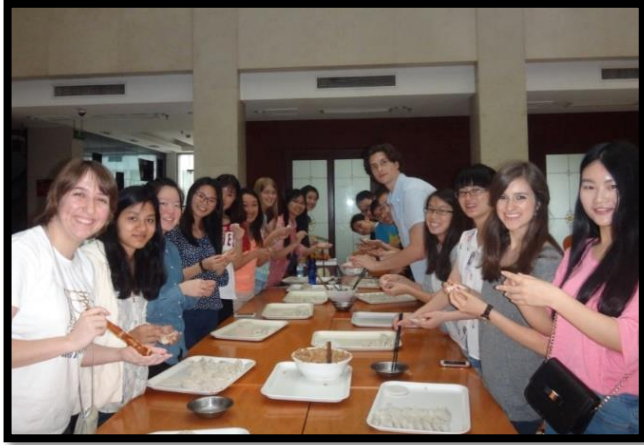
Students from the 2015 Rice-in-China program making dumplings with students from Nanjing University