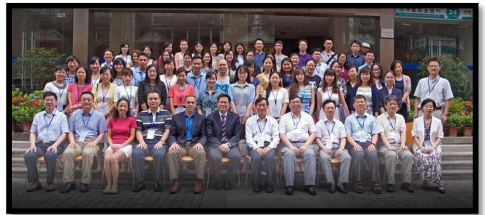
A group photo from last summer’s International Conference on Spoken Chinese Corpora held at Nanjing University

corpus of medical conversation used to design the course ‘Chinese for Medical Professions,’ as well as present a research project revealing how the natural language data in corpora help develop beginning students’ interactional competence.